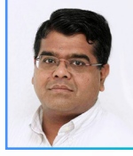
Sh. T. V. Somanathan Finance Secretary of India