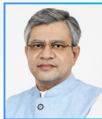
Sh. Ashwini Vaishnaw Cabinet Minister, MeitY