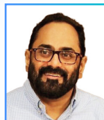
Sh. Rajeev Chandrasekhar MoS (Electronics & IT)