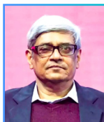
Dr Bibek Debroy Chairman, PM's Economic Council