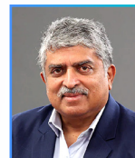
Sh. Nandan Nilekani Non-Executive Chairman of Infosys