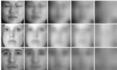
Figure 3. Cropped face image examples. From left to right: high resolution ( 32 \times 32 ) followed by low resolution ( 16 \times 16 , 8 \times 8 , 6 \times 6 , 4 \times 4 ) images.

are significantly better than that of LDA, indicating that the coupled projection strategy for heterogeneous face recognition is effective. The KCSR and ICSR which adopt nonlinear technique perform better than LCSR. The RBF kernel is helpful to improve the separability of samples. Comparing ICSR with KCSR, their performances are similar for 16 \times 16 and 8 \times 8 resolutions. However, in the lower resolution of 6 \times 6 and 4 \times 4 , ICSR outperforms KCSR significantly. ICSR improves the recognition rate by 6~20 percent when the low resolution size is 4 \times 4 . In KCSR, the projections for high and low resolution data are derived from the high and low resolution samples, respectively. ICSR learns the coupled projections by utilizing high and low resolution images together. The good performance of ICSR, especially in lower resolution cases, validates that it is possible to explore more discriminative information between heterogeneous data. This along with the locality constraint are helpful to improve the generalization capability. Overall, ICSR achieves better recognition performance than the original CSR.