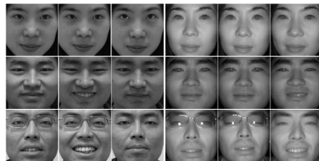
Figure 4. Cropped VIS and NIR face image examples. The left three columns are VIS images and the right three columns are NIR images.

in total, including 2,095 VIS and 3,002 NIR images from 202 persons in the database. In this experiment, two protocols are designed to evaluate the performance of different methods. In protocol I, we randomly select 1,062 VIS and 1,487 NIR images from 202 subjects and the remaining images form the testing set. The persons in the testing set are all included in the training set. In protocol II, the training set contains 1,438 VIS and 1,927 NIR images from 168 persons and the testing set contains 657 VIS and 1,075 NIR ones from 174 persons. The persons in the testing set are partially included in the training set. In testing phase, the NIR images are compared with VIS images and the recognition rate and receiver operating characteristic (ROC) performance are reported. All images are cropped into 32 \times 32 size according to the automatically detected eye coordinates. Fig. 4 shows some VIS and NIR face images from the database.